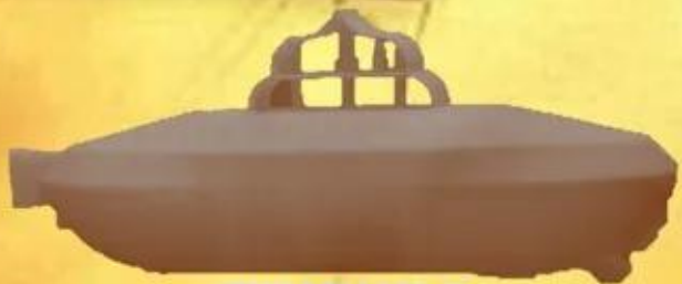
TRIPURA ALL PURPOSE AIRCRAFT