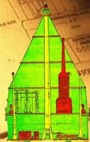
SUNDAR FIGHTER PLANE 3600 MPH